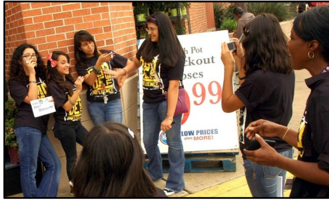
Houston-area teen girls participating in the “Tag It” activity creatively demonstrate how they are “above peer pressure.”

Teens from the Coalition of Behavior Health Services conducted a week of “Above the Influence” activities during a local art festival, including the “Tag It” activity, creation of an ATI art mural that traveled to various Houston-area locations, teen panel discussions, and a free concert by a local hip-hop dance group.